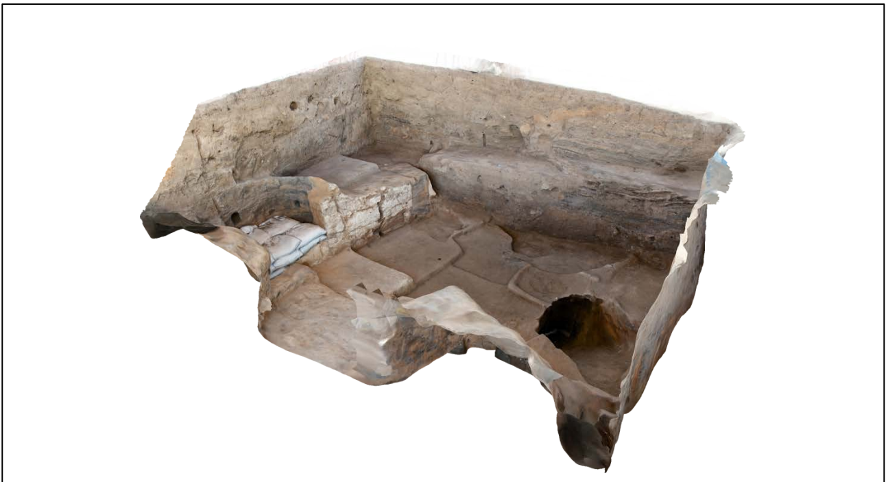
Figure 4.2. 3D model of B. 121. Model: Jason Quinlan

Since Trenches 1 & 2 are connected, and different structures are placed in both of them, it is justified to discuss the results of this year's works in one section. The works in the past two seasons made it possible to reveal and analyze a distinct and coherent sequence of a number of superimposed Neolithic houses and adjacent features and layers possible.