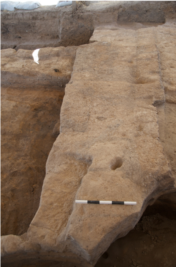
Figure 4.6. Walls F.7171 and F.7176.

In the 2013 season, excavation works were also continued in Trench 3. Altogether, a number of Neolithic features was recognized, several of which have been truncated or disturbed by later inhabitants of the area. They also brought about excavation of later remains, in particular a large Hellenistic Building 120.