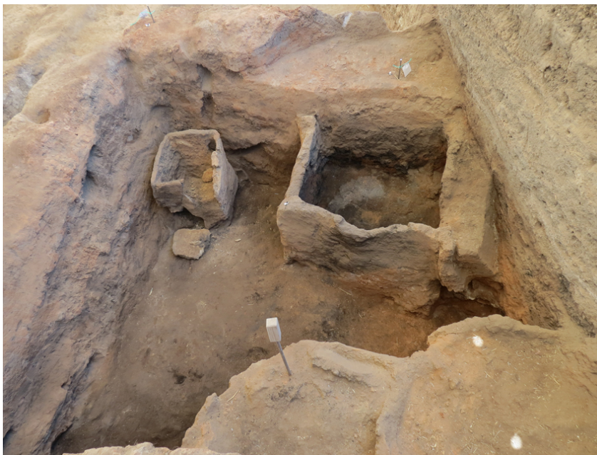
Figure 4.7. of space 493 and its bins.

Due to post Neolithic destructions and the limited area under observation, an understanding of spatial arrangements is currently limited. However, it is more likely that we are dealing with two solid Neolithic buildings, placed one next to the other (B. 122 in the north and Space 520 to the south). As the latter one is clearly placed slightly below the former one, this may indicate some kind of terrace. Another E-W terrace was probably located along the slope further to the south. Its northern face was later used to construct the northern wall of the Hellenistic building, B. 120 (see below), built directly against it. These may be indicative of a terracing pattern in this part of the mound and placement of a row of houses on subsequent terraces, all facing south. The terracing of the mound surface in the Late Neolithic would not be surprising considering the discussed buildings were constructed on a significant slope. The Neolithic builders must have been forced to follow the contours of the mound.