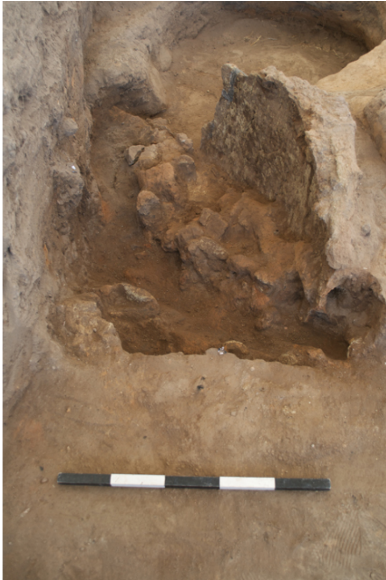
Figure 4.4. Oven F.3955.

The earliest in the sequence is oven F. 3955 (Fig. 4.4). Its construction led to the destruction of western sections of the southern wall of B.110 and northern wall of B.121. Approximately only 10 per cent of the oven was found within the trench. Despite the fact that its significant western part is located beyond the western edge of Trench 2 and hence it was only partly excavated, it is clear that it was a very substantial construction with a domed superstructure and very solid walls of ca. 10 cm thick. They were greenish from the inside, c. 2 cm thick followed by the layer of burnt clay. This is