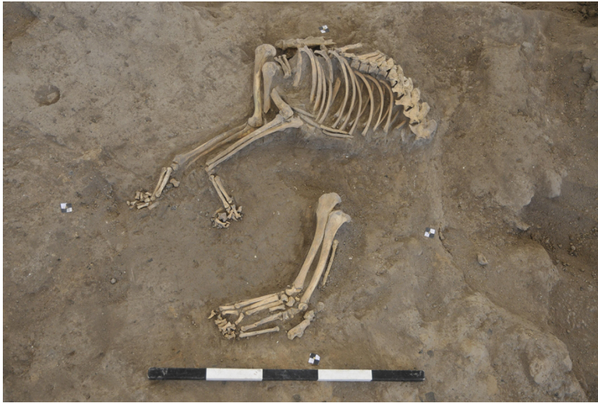
Figure 4.5. Dog burial F.3997.

its infill characterized by a significant degree of homogeneity (F.3997, F.3969, F.3999, F. 7156, F.7155, F.7158). They were of a rounded/ovoid shape, all similar. It is difficult to state the time difference between the abandonment of the pit F. 7154 and the construction of this set of pits on its top. Particularly interesting is F. 3997, where a dog burial was identified (Fig. 4.5). The skeleton was almost completely preserved except for the skull, pelvis and upper hind limbs. It was placed on the right hand