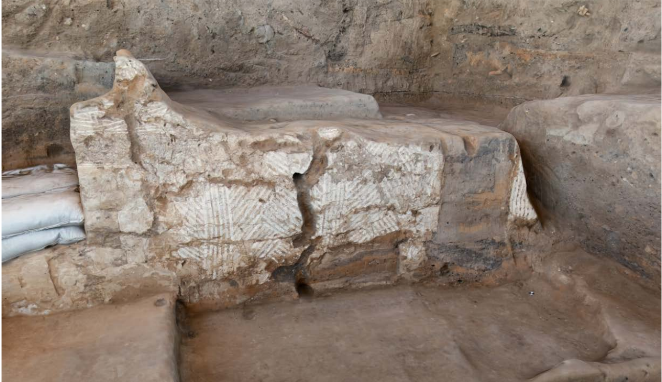
Figure 4.3. The painted eastern wall of B.121.

Only two walls of the building are placed in Trench 2, while the remaining two are located outside its perimeters, the western one probably very close beyond the edge of the trench. The eastern and